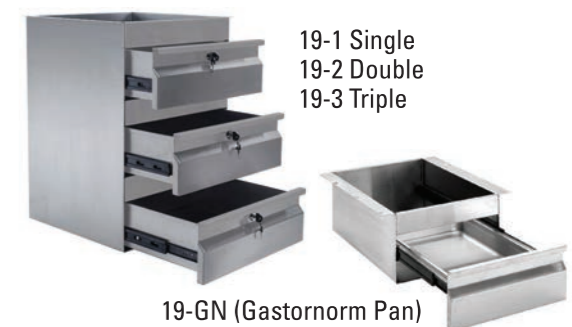
19-1 Single 19-2 Double 19-3 Triple