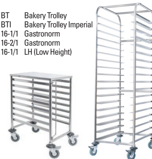
BT Bakery Trolley BTI Bakery Trolley Imperial 16-1/1 Gastronorm 16-2/1 Gastronorm 16-1/1 LH (Low Height)