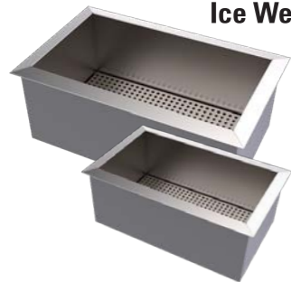
41.IWS (400 x 400 x 225) 41.IWB (775 x 480 x 300)

Ice Well lids and dividers (Optional extra)