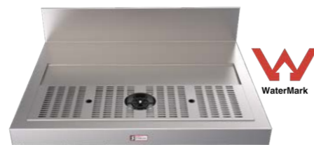
SBM-BS-GR-6-0950 | SBM-BS-GR-7-0950 SBM-BS-GR-6-1300 | SBM-BS-GR-7-1300