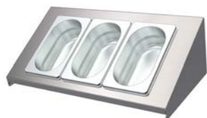
SBM-CH-3 (404 x 303 x 140) SBM-CH-6 (785 x 200 x 155) (Dishes not included)