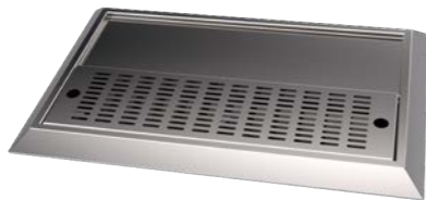
SBM-CTBS-0400 | SBM-CTBS-1200 SBM-CTBS-0600 | SBM-CTBS-1500 SBM-CTBS-0900