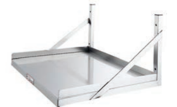
28-MW-0450 | 28-MW-0580