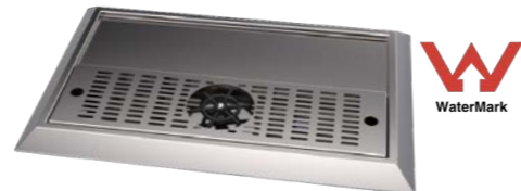
SBM-CTBS-GR-0400 | SBM-CTBS-GR-1200 SBM-CTBS-GR-0600 | SBM-CTBS-GR-1500 SBM-CTBS-GR-0900