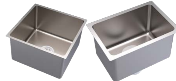
SBM-HB (200 x 300 x 185) SBM-WS (400 x 400 x 250) SBM-WSC (Wash Sink Cover)