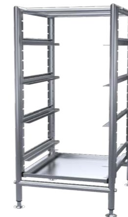
36.GR | 36.DGR