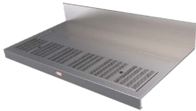
SBM-BS-6-0950 | SBM-BS-7-0950 SBM-BS-6-1300 | SBM-BS-7-1300