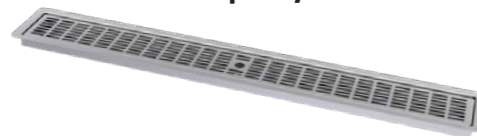
SBM-DT-0300 SBM-DT-0600 SBM-DT-0900